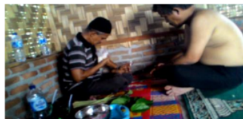
Figure 2: The handler is reciting the Old Ethnomedicine Mantra for healing Chronic Lung disease.

The Serdang Malay community in Kuala Lama Village, Pantai Cermin District, Serdang Bedagai Regency still uses the Serdang Melayu Ethnomedicine Old Mantra in treatment. This was triggered by the many cases where they were declared medically incurable, prompting them to ask for healing through the handler who recited the Prayer for healing to Allah in the old Malay Serdang mantra.