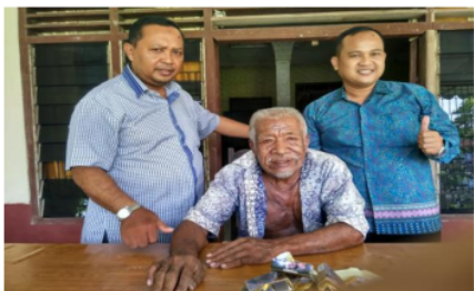
Figure 4: Researchers with caretaker (Kuncen) Kuala Lama Village, Pantai Cermin District, Serdang Bedagai Regency (Documentation 3 July 2023)