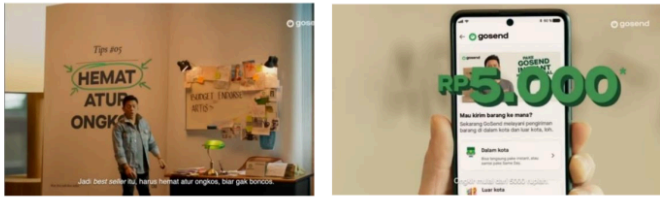
Figure 4. Advertisements offer affordable prices for using their services

goods that will be sent using Gojek Indonesia because they offer insurance if the goods are lost or damaged during the shipping process. . People are certainly more interested and think that their goods will be safe until they reach their destination, even if not they will receive compensation for the goods they will send via Gojek Indonesia.