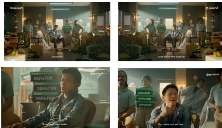
Figure 1. Opening advertisement that illustrates the meaning of the word entrepreneur

To see how the selected advertisements are influenced by social conditions in society, the researchers will present several images capture from the Gojek Indonesia #BestSellerGoSend Bareng Ariel Noah advertisement to see the social practices contained in the advertisement.