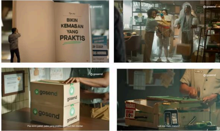
Figure 2. Offering practical packaging to customers

entrepreneur where the words contained after it are "more suitable wira sulit ah. It's hard to start a business". This is because the advertiser knows that the public's pessimistic attitude to starting their own business is still small. Many doubts arise such as fear of no buyers, fear of running out of money for business costs, and fear of losing to other people's businesses. The word "entrepreneur" can be very powerful because many Indonesian people have jobs as entrepreneurs with their own businesses. This illustrates that people in the social environment in terms of building a business, like to find out tips "so that the business becomes big, sells well, and is in demand by many people. It is not uncommon for fellow entrepreneurs in Indonesia to exchange ideas in terms of the business world. Therefore, the social practice contained in the advertisement above is the biggest problem in society, namely the difficulty of starting a business.