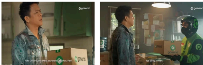
Figure 3. Insurance from GoSend when sending goods

The words used in this advertisement such as "if you pack it, don't bother, bro" are a depiction of product packaging that is considered complicated and convoluted. In society, this is a common thing where people pack their goods with thick tape in the hope that the product will be safe. Not infrequently, people also use wood to pack their products which is considered bad and requires extra effort to pack it. In this advertisement, the advertiser offers practical packaging using a box specially designed for its customers. The word "practical" in the offering of a brand or product is an important thing that everyone wants, especially in today's online era and can make all life's affairs easier and faster. In this way, it won't cost more just to pack.